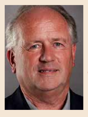
Yes, the western world is flirting with a currency war.

policy in the next recession, it is the United States, which has an unsustainable trajectory of net international debt owing to chronic trade deficits. Correcting the U.S. trade deficit may require a different monetary-fiscal policy mix along with some intervention in foreign exchange markets. But in the event of a global recession, the United States should refrain from direct currency action provided that its trading partners also refrain. Dealing with the U.S. trade deficit should wait until global recovery is firmly established.