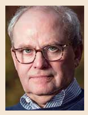
Currency wars no longer appear likely.

In this forum, TIE has reminded its readers how bad protectionist pressures were in the United States just before the Plaza Accord was signed in September 1985, when the exchange rate was 240 yen to the dollar. By the time the Louvre Accord was signed in February 1987, the rate had fallen to 150 yen to the dollar and protectionism was no longer an issue in Washington. Instead of allowing the highly unpredictable and arbitrary "tariff man" to run amok on this trade imbalance problem, it would be far better for the surplus countries to jointly realign their exchange rates and thereby safeguard the free trade system that has benefitted them and the rest of the human race so much since 1945.