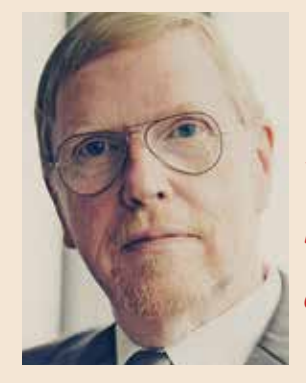
There are some worrisome parallels between the 1930s and today.

simply in an effort to get fiscal policymakers to act. We have a technical economic term for such monetary inaction: it's called "cutting off your nose to spite your face."